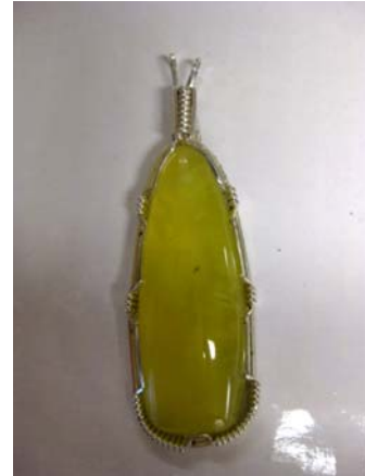
Also from the Wednesday Silver group- Senga Smith's stunning wire wrapped Pendant