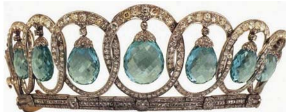
Queen Victoria Eugenie of Spain's Parure Tiara was adapted to use aquamarines instead of pearls.