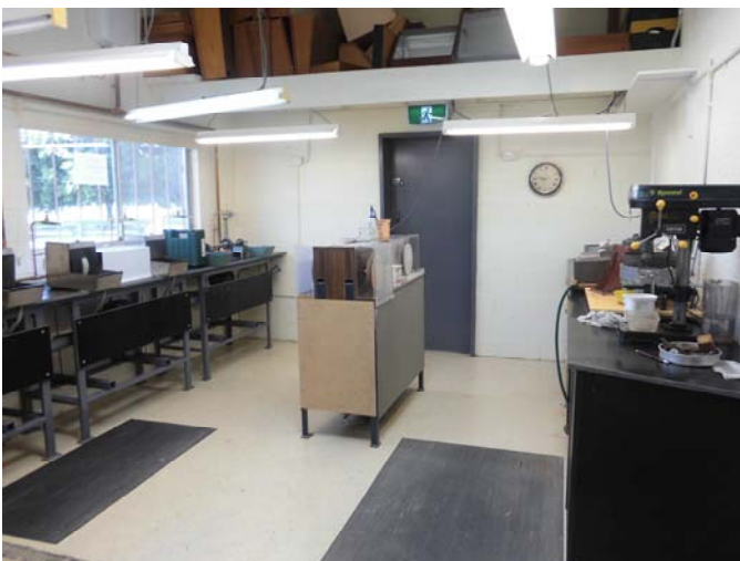
Another view of the renovated Cabbing rooms