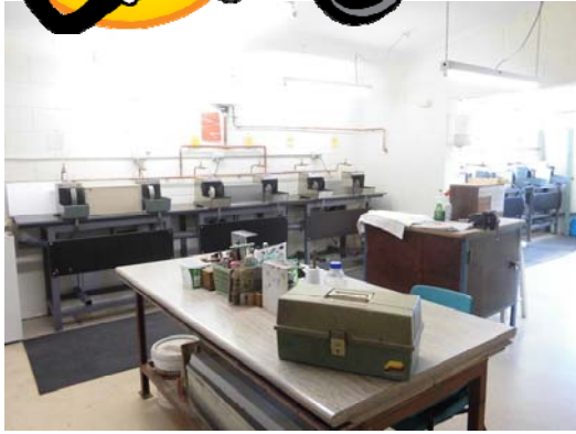
Our NEW LOOK Cabbing room