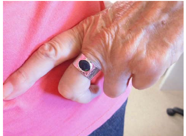
Senga's Silver ring, unfortunately the photo does not do it justice.